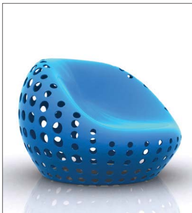
Porous Chair. Recycled Plastic Chair. MisoSoupDesign. www.misosoupdesign.com