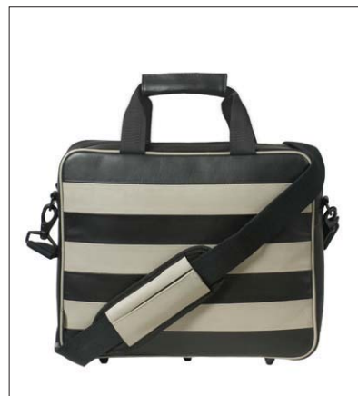
Mars Laptop Bag. $270. Zomoy. Amsterdam. www.zomoy.com