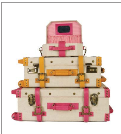
SteamLine Luggage. $95-495. SteamLine. Dublin, Ireland www.steamlineluggage.com