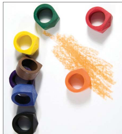
Crayon Rings. Sold in sets of eight. $60. Timothy Liles. Washable Crayon Rings. www.thefutureperfect.com