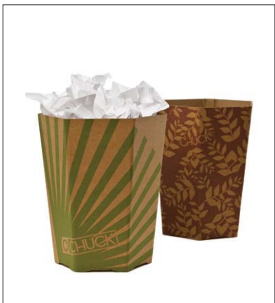
Chuck. $15. World's 1st modern waste paper basket constructed of 100% recycled cardboard. www.chuck4life.com