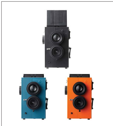
Blackbird.fly. $155. Blackbird, fly. Japan. www.superheadz.com/bbf/