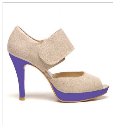
Balance. 100% Vegan Shoes. $245. Elizabeth Olsen. NY. USA. www.olsenhaus.com