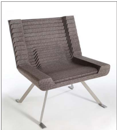
Relief Chair. Layered Felt. $4870. Mickus Projects. NY. USA. www.branchhome.com