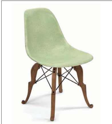
Prince Charles Side Chair. $485. Fiberglass side shell / solid walnut legs. www.modernica.net