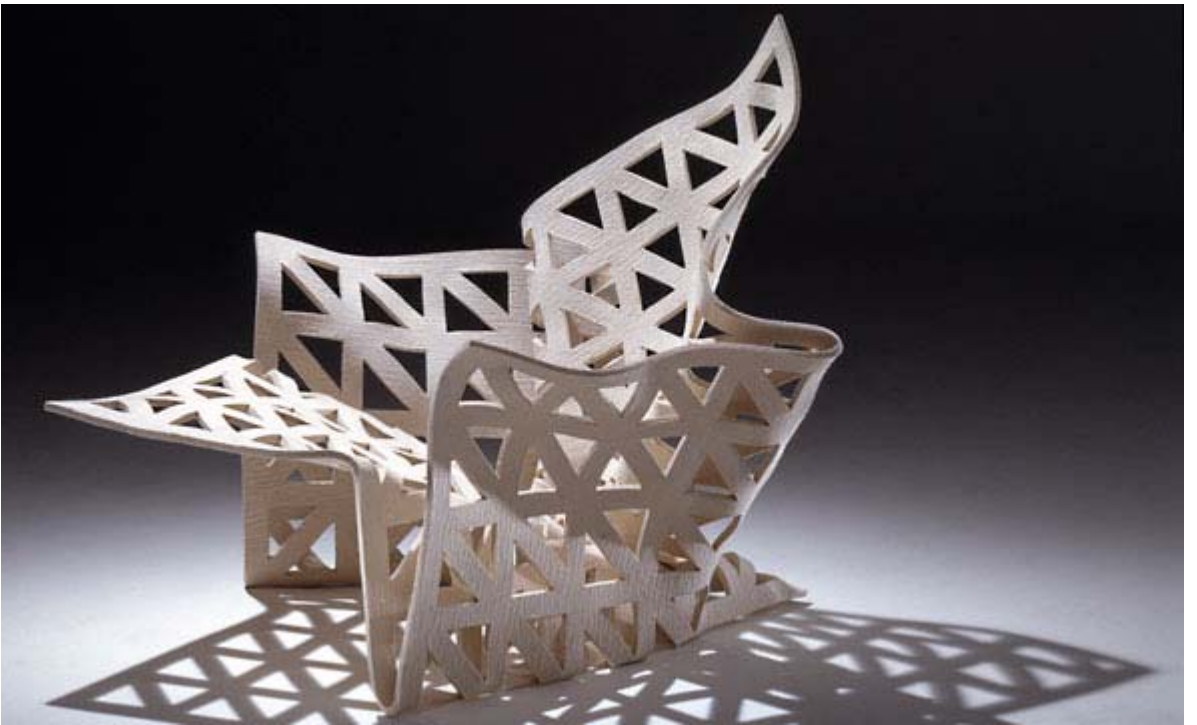
"Bless You" chair by Louise Campbell.

Felt, an inherently sustainable resource, is made by the matting together of wool fibers. Unlike its sister fabrics which employ looms or forms of knitting, felt has no internal structure and is formed by a process of pressing, agitating, and molding the fibers. The versatile material is known to apply to numerous industrial uses, and even acts as a temporary dwelling textile for some Central Asian nomadic tribes.